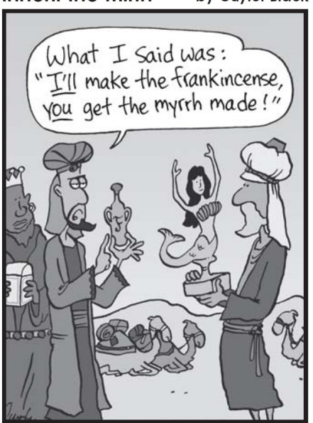
from JoyfulNoiseletter.com © Cuyler Black Reprinted with permission

TLC FINANCIAL INFORMATION July 1, 2014 – November 30, 2014