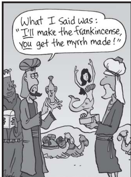
from JoyfulNoiseletter.com © Cuyler Black Reprinted with permission